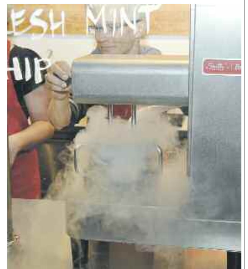
"Brrr" churns and instantly freezes ice cream.